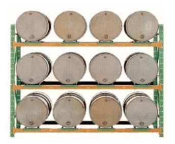
Figure 7-2. Drums elevated on a storage rack. Drums are also subject to secondary containment requirements for bulk storage in §112.8(c)(2).

drums, even if elevated, remain subject to the bulk storage secondary containment requirements in $112.8(c)(2) or $112.12(c)(2). Determination of environmental equivalence is subject to good engineering practice, including consideration of industry standards, as certified by the PE in accordance with $112.3(d).